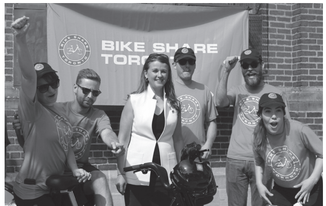
ANNOUNCING A FEDERAL INVESTMENT OF $1.25 MILLION TOWARD 50 BIKE SHARE TORONTO STATIONS